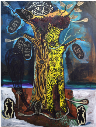
Baum VI, 200×150cm, 2020