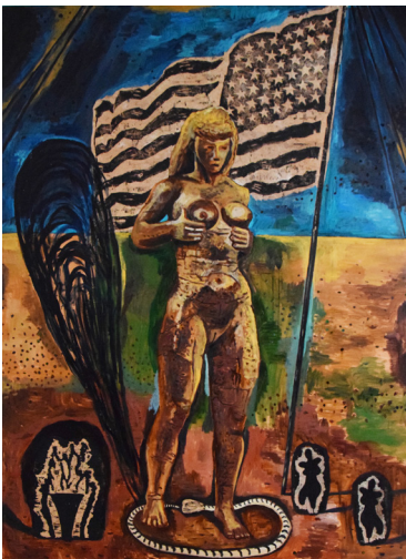
Great american nude 3, 250×180cm, 2020