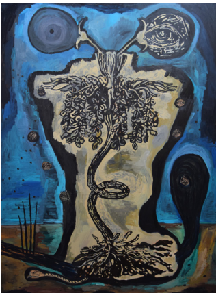
Seeds, 200×150cm, 2020