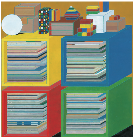
Peng Jian, Quartet (detail), 2015