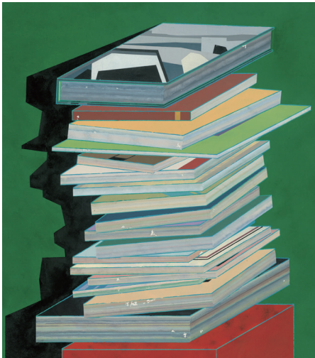
Peng Jian, No Comment (detail), 2015