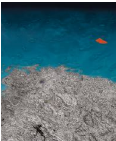
Floating Island (detail), 2015