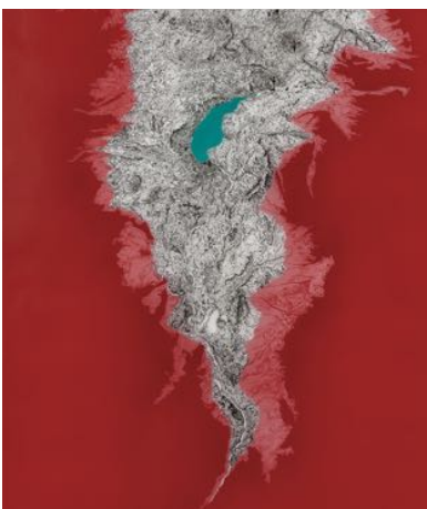
Green Lake (detail), 2015

Hadrien de Montferrand Gallery is delighted to announce Zhu Rixin's first solo show "Boundary" featuring archival ink pen, acrylic and spray paint on tracing paper and canvas.