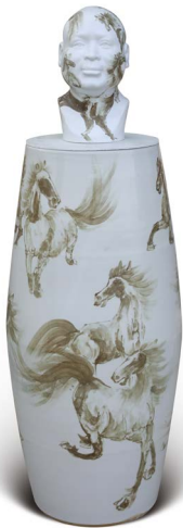
Fragile Body No.11, 2017