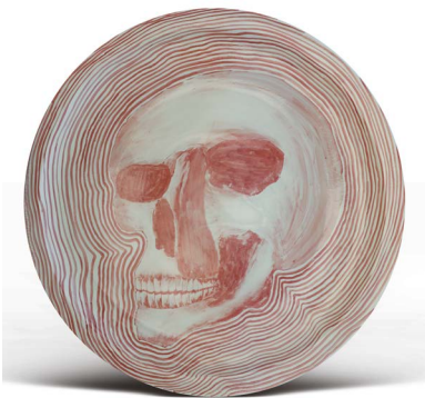
Fragile Body No.1, 2017