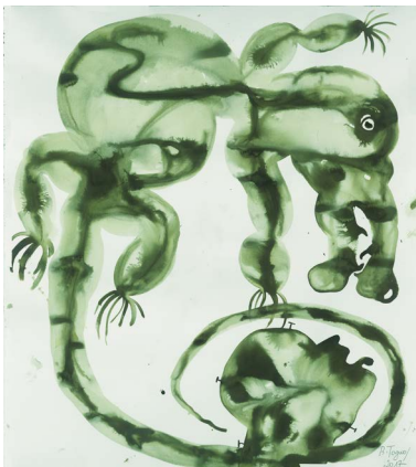
Fragile Body No.17, 2017

“ It is obvious that Toguo does not belong to the artistic type that goes in for profundity and complexity. His pieces retain an enthusiasm which is poised to take action at any time. The conceptual framing sets brings about distinct effects of tension rather than merely grafting on slogans, news reports and calls-to-arms. In Fragile Body his choice of the ceramic medium, in and of itself, goes a long way toward explaining his message: life itself is lustrous but fragile. What is more, he places a porcelain rendering of his own head at the mouth of a bottle. Not only does this highlight a lyrical impulse to merge with dreams, it also indicates an individual’ s tininess, finitude and fragility. Our environment in the current world is narrowing like a bottle, within which the corporeal body of each individual is confined.”