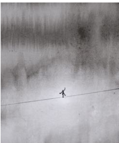
Funambulist No.1 (detail), 2016

Hadrien de Montferrand Gallery is delighted to announce a solo show of Lu Chao entitled "Black Box" on March 11 featuring more than 10 recent works of the artist including oil paintings, works on paper and paintings on wood board. Following on the solo shows "Black Forest", "Black Mirror" and "Black Light", this is the fourth cooperation of the artist with the gallery. The artist uses painting to express feelings of mystery and strangeness.