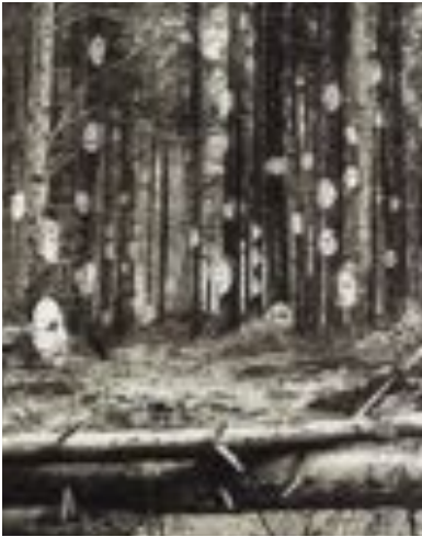
Black Light No.4 (detail), 2016