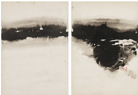
Untitled , 70 × 100 cm (diptych), 1970's

HdM Gallery is delighted to announce our forthcoming exhibition, showcasing works on paper of Chinese artist T'ang Haywen. An important figure in Modern Ink, T'ang Haywen belongs to the group of Chinese painters who settled in Paris after World War II. This background is reflected in his works, which straddle the two cultures – amalgamating the traditional Chinese aesthetic of ink brush painting and Western abstract expressionism.