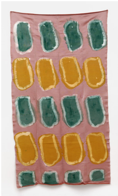
Claude Viallat, 2016/100 , 2016