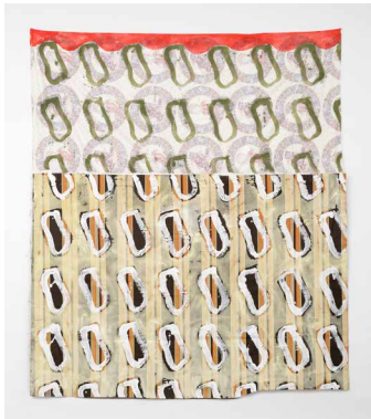
2018/0489, 310 × 264 cm, 2018