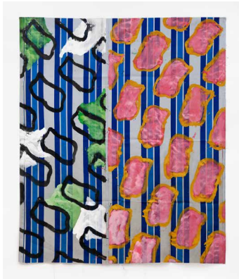
1994/061, 246 × 208 cm, 1994