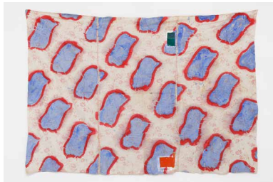
1995/065, 170 × 250 cm, 1995

HdM GALLERY Beijing is pleased to present a solo exhibition of Claude Viallat. The show will open on Oct 26th, 2019 and last until Nov 23rd, 2019. This is the second presentation for the artist in the gallery after a dual show with Wang Yi entitled “Inside and Outside” in 2018. This will be the first solo show of Claude Viallat since “Repetition” in 1999 was shown in Chengdu, Kunming and Shenyang. The exhibition in Beijing will include more than 15 works dated between 1992 and 2018 on curtains, parasols, table cloths and canvases.