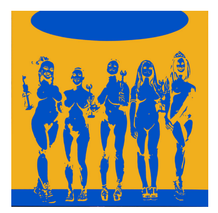
Nuage sur des horizons dénudés, 100 × 100 cm, 2018