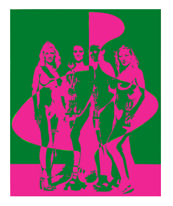
\textit{Menthe et framboise}, 162 \times 130 \text{ cm}, 2018