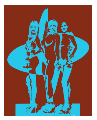
Tout ça pour du caramel, 100 \times 81 cm, 2018