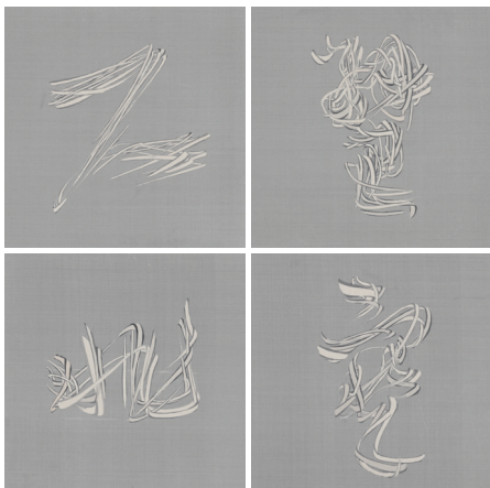
Hao Shiming, Chi, Bi, Fei, Bao (A block of jade is no treasure) , 2015

Hadrien de Montferrand Gallery is pleased to present "Focus", a solo show of Hao Shiming, from September 19 th to November 3 rd 2015. The show features a selection of 30 works with contemporary ink as its theme.