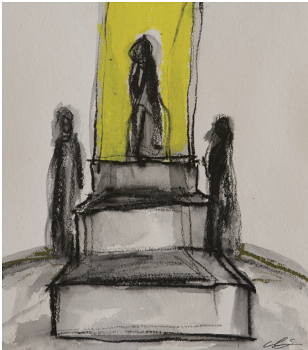
Chiharu Shiota, Light , (detail), 2014