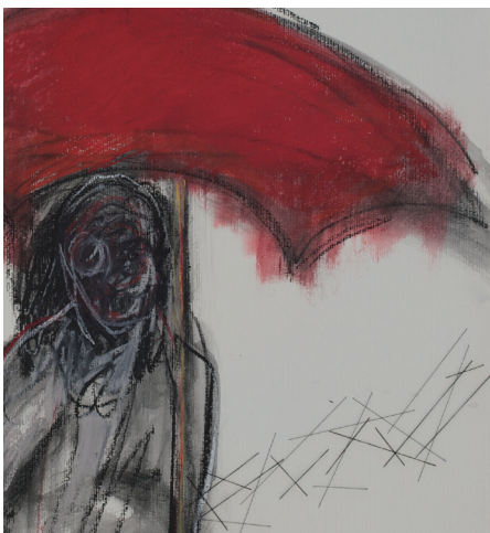
Chiharu Shiota, Red Umbrella , (detail), 2014