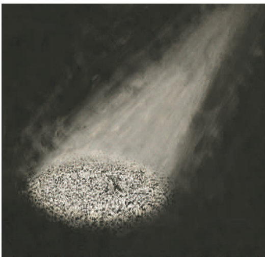
Stage (detail), 2013