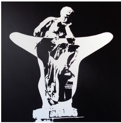
But how did he manage, 2015