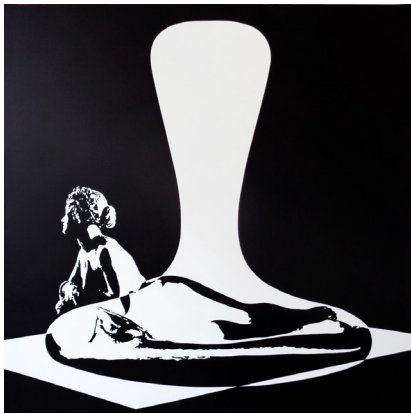
If you knew how I don't give a shit, 2015