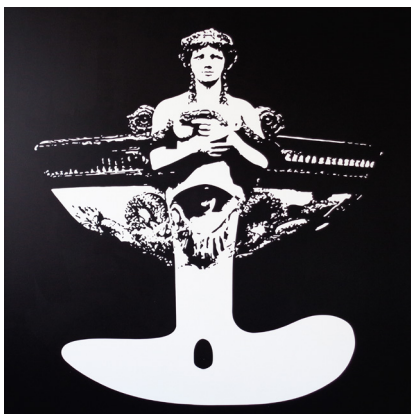
More or less, she doesn't give, 2015