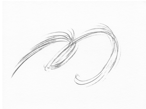
Zhao Zhao, One Second (selected), 2015