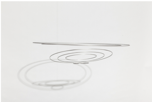
Elias Crespin, Circuconcentricos Titan 60 , 2018