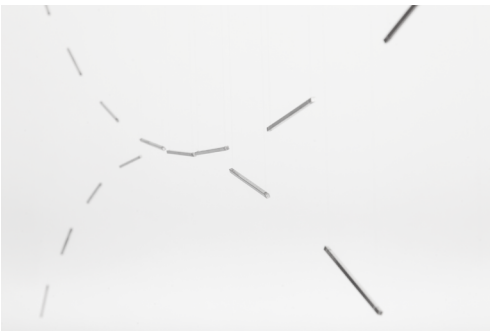
Elias Crespin, Linea Inox , 2016

HdM GALLERY is delighted to present their first exhibition, combining the works of two applauded contemporary artists – Chinese artist Zhao Zhao and Venezuelan-born Elias Crespin. The works will be displayed side by side, allowing them to interact, counteract, and create an alternative narrative.