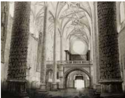
Black Light No.6, 2018