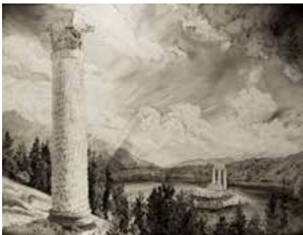
Relic No.5, 2018

This Spring HdM GALLERY will present 'Black Dots' by Lu Chao. The sixth instalment in a range of sequential exhibitions exploring the colour black, 'Black Dots' continues Lu Chao's trademark investigation into issues of identity and the unknown, mass society vs. the individual. Following exhibitions at HdM GALLERY in Beijing, this will be Lu Chao's fifth show with the gallery and his first exhibition at the London gallery. The show will open on March 7th and last until May 11th 2019.