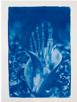
Hu Weiyi, Blue Bones No.5 , 51×36 cm, 2020